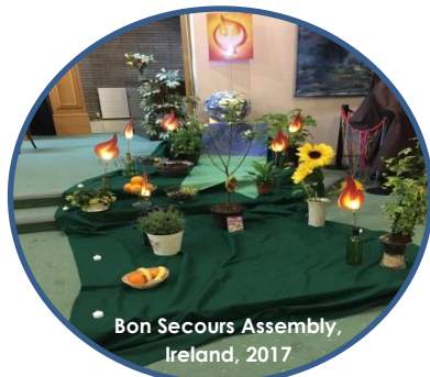
Bon Secours Assembly, Ireland, 2017

Our spirituality is a oneness and an interconnectedness with all that lives and breathes even with all that does not live or breathe.