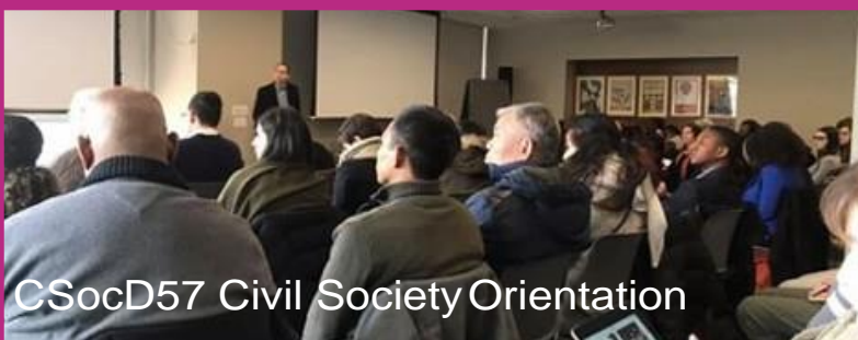
CSocD57 Civil Society Orientation

Education is a human right, a public good and a public responsibility. It is fundamental in ensuring every individual has the knowledge and skills needed to access opportunities to participate fully in society and contribute to sustainable development. By proclaiming the International Day of Education, UN member states recognized the importance of working to ensure inclusive, accessible and equitable quality education at all levels. While the right to education is enshrined in various UN Declarations, Agendas and Conventions, among the most notable; Universal Declaration of Human Rights, Convention on the Rights of the Child, and the 2030 Agenda for Sustainable Development, there is still a long way to go. Did you celebrate the first International Day of Education? If you did, we would love to hear about it!