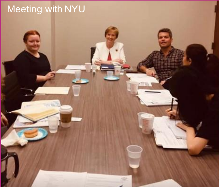
Meeting with NYU